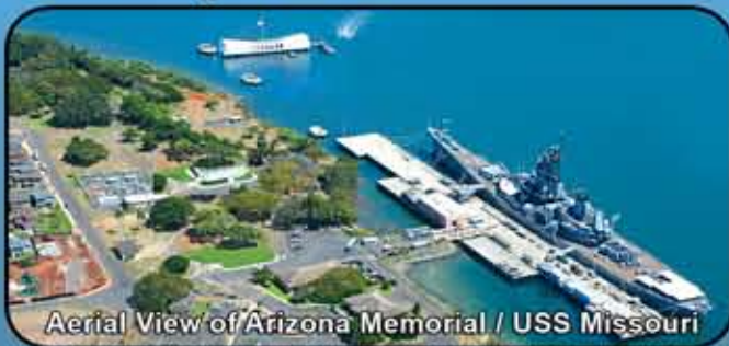
Aerial View of Arizona Memorial / USS Missouri

Featuring Authentic WWII Exhibits and Museums