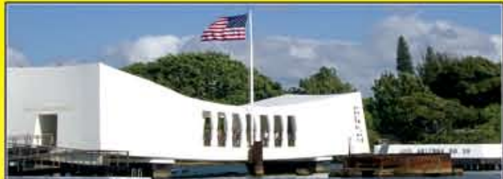
Pearl Harbor Tours