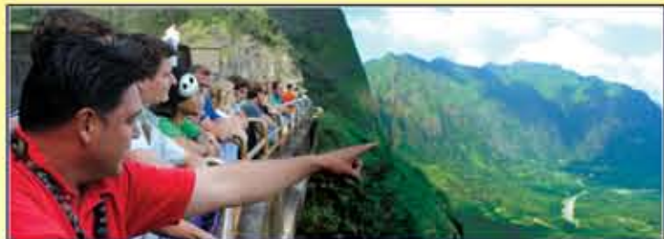
Scenic Island Tours