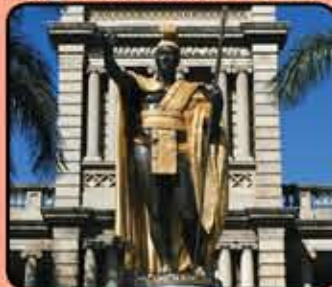
Aloha Stadiums Flea Market