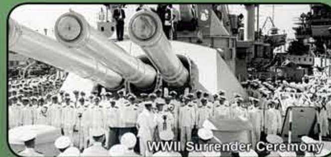
WWII Surrender Ceremony

Featuring guided tour of the USS Missouri Battleship