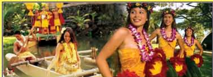
Polynesian Cultural Center Excursions